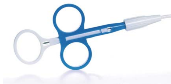
Ergonomically shaped 3-ring handle